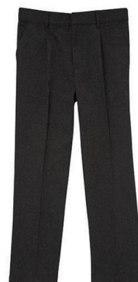
Tesco Boys Pleat Front School Trousers