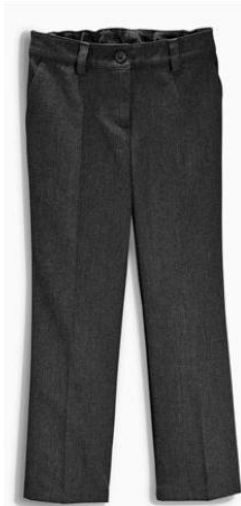
Next Girls Grey Woven Trousers