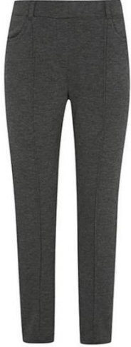
ASDA School Skinny Treggings