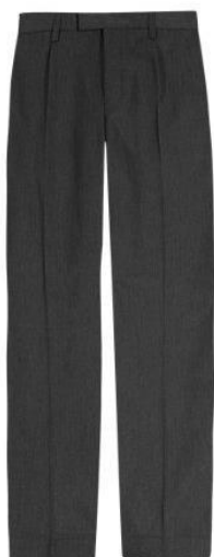
Marks and Spencer Boys Pleat Front