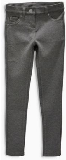
Next Ponte Trousers