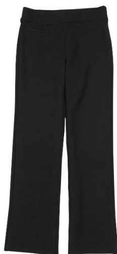
Marks and Spencer Girls Cotton Rich Trousers