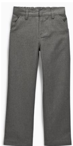
Next Boys Flat Fronted Trousers